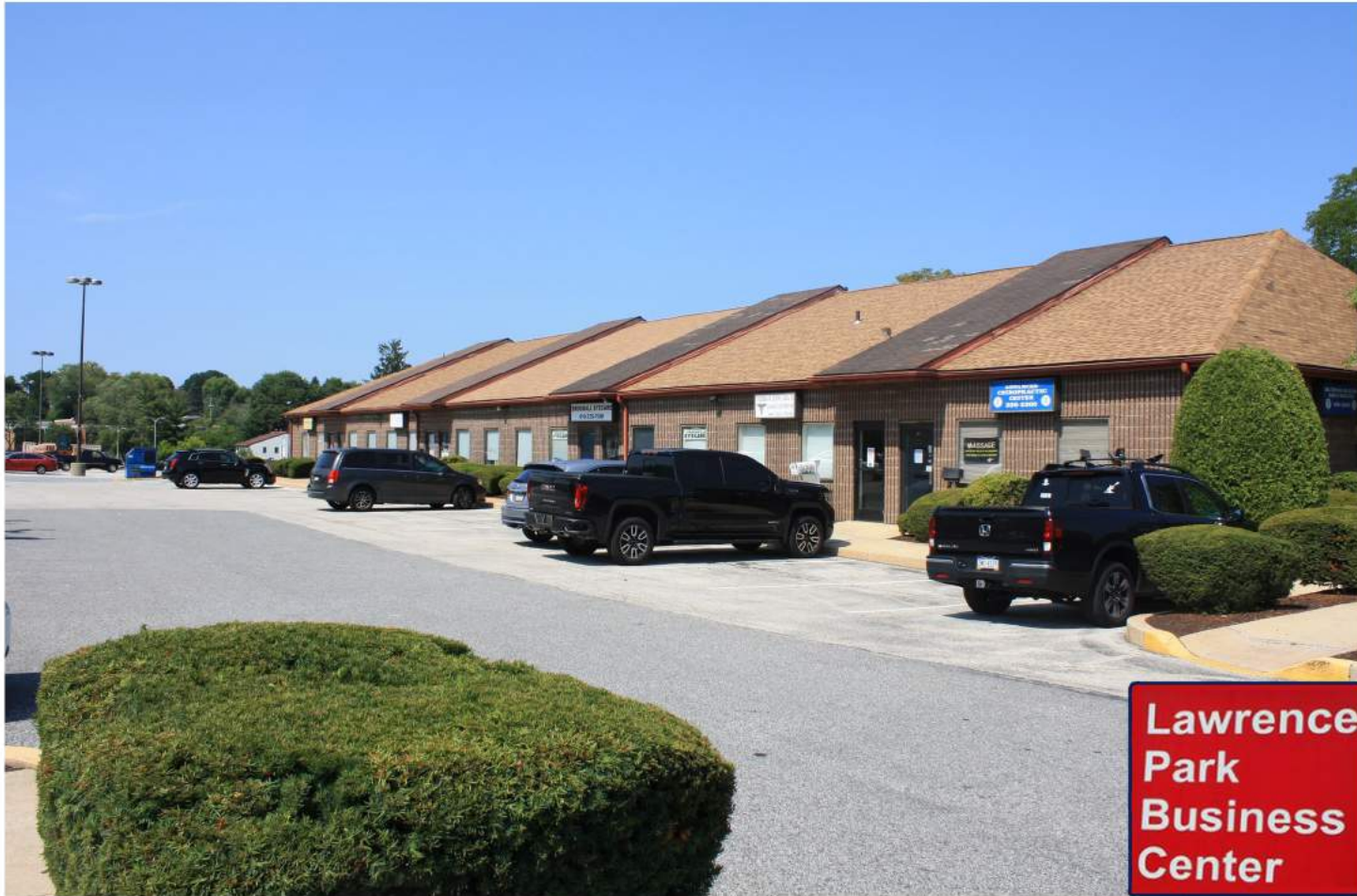
Lawrence Park Business Center